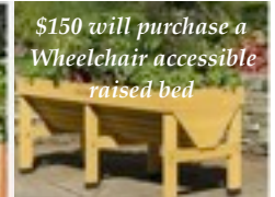
$150 will purchase a Wheelchair accessible raised bed

Rise to the Time is a registered 501 (c) 3 and is funded strictly by your donations. Thank you for your continued prayers and support. For your convenience, you can visit our website at www.Risetothetime.org to make an on-line donation.