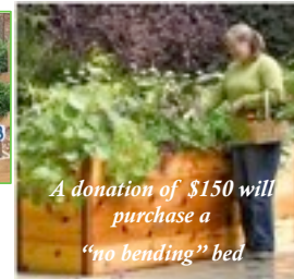
A donation of $150 will purchase a "no bending" bed