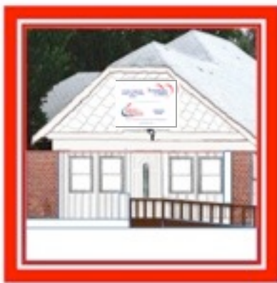
The Vision for the Front of the building...after completion!