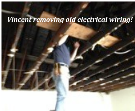
Vincent removing old electrical wiring!

We FINALLY have our building permit and construction has begun! Since our last newsletter all the preliminary demolition