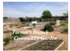
Farmer's Branch Community Garden